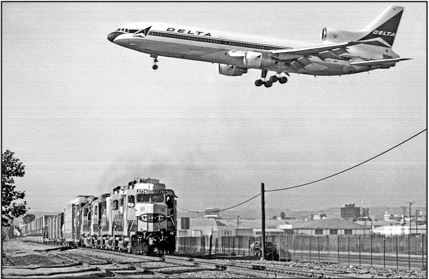
A Delta airlines jet approaches LAX as a westbound “Extra Harbor” train passes at the LAIRPORT station in El Segundo, California.