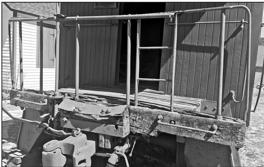
The deteriorated end sill on caboose 10600.