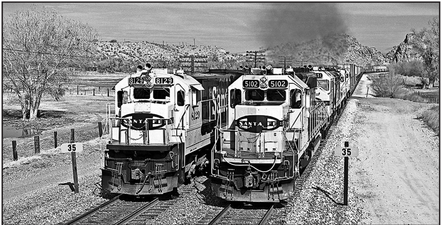
A westbound hot shot is passing the westbound “Harbor” train stopped at Frost station in Victorville, California, picking up rear end helpers.